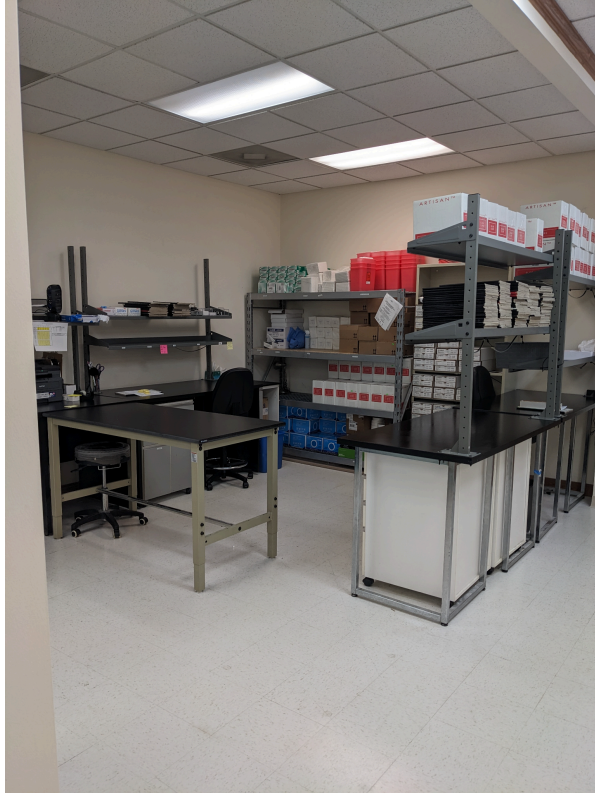
New lab processing space

The new state-of-the-art equipment and improved Histology workflow reflect CPC's commitment to quality and excellence in our pathology services.