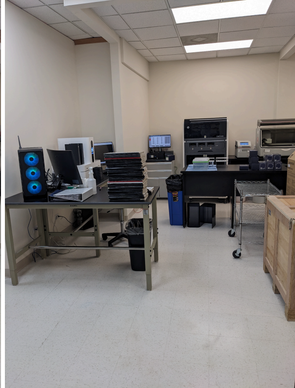
New lab space - imager and IHC stainer

You might be asking - "Where are the people?" Great question! The images here were taken after very busy overnight/early morning hours, and the histotechs and lab aides are home sleeping after tidying up and preparing for the next night ahead.